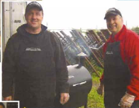
Our Great Chef's – thanks guys Picnic in the Park